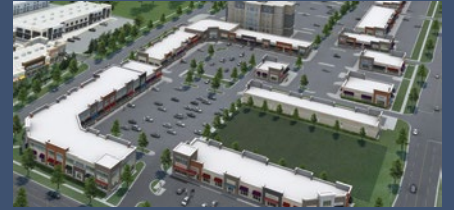
ERIN MILLS COMMERCIAL CENTRE PHASE I