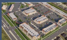
MCVEAN COMMERCIAL CENTRE