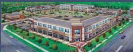
BRAMPTON MARKET SQUARE