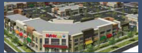
AIRPORT AND BOVAIRD COMMERCIAL CENTRE