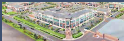
BRAMPTON TOWN CENTRE