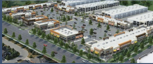
ERIN MILLS COMMERCIAL CENTRE PHASE II