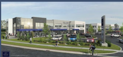
407 KEELE CENTRE