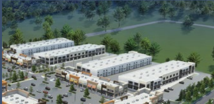
ERIN MILLS COMMERCIAL CENTRE PHASE III